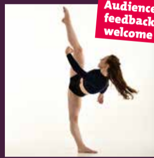
Audience feedback welcome

This hooptastic comedy show is packed with highly skilled hula hoop tricks, iconic music and a whole lot of heart. Take a journey through the ages and across the globe, from the giant 6ft hoop, through to the multi-hooping human tower.