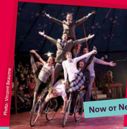
Now or Never